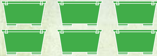
6 x 3.0 cubic metre bins